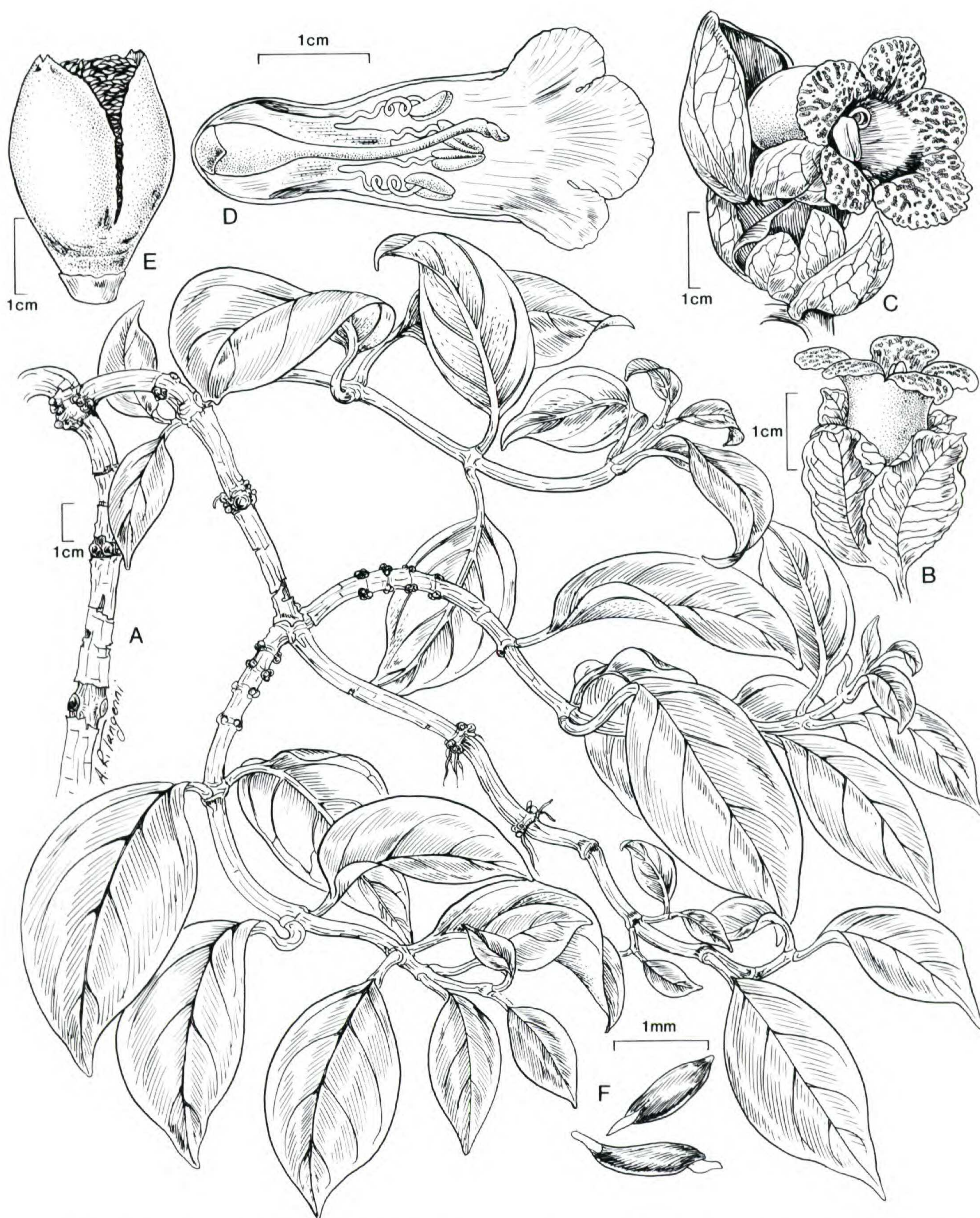
Figure 2. Drymonia pudica . —A. Habit. —B. Flower. —C. Flower (face view). —D. Corolla cut open, with stamens, nectariferous gland and pistil. —E. Capsule. —F. Seeds. (A from living material and Steyermark 91529; B, C from Steyermark 106287; D from Killip & Lasser 37765; E, F from Steyermark 91529.)

Pittier National Park in Venezuela in 1968 and sent it to Cornell University where it was grown as G-1292. Plants of this species are still in cultivation from both the Steyermark and the Bunting collections.